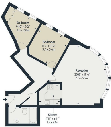
First Floor Floor Area 792 Sq Ft - 73.58 Sq M

Abney Park Court, N16 Approx. Gross Internal Area 792 Sq Ft - 73.58 Sq M